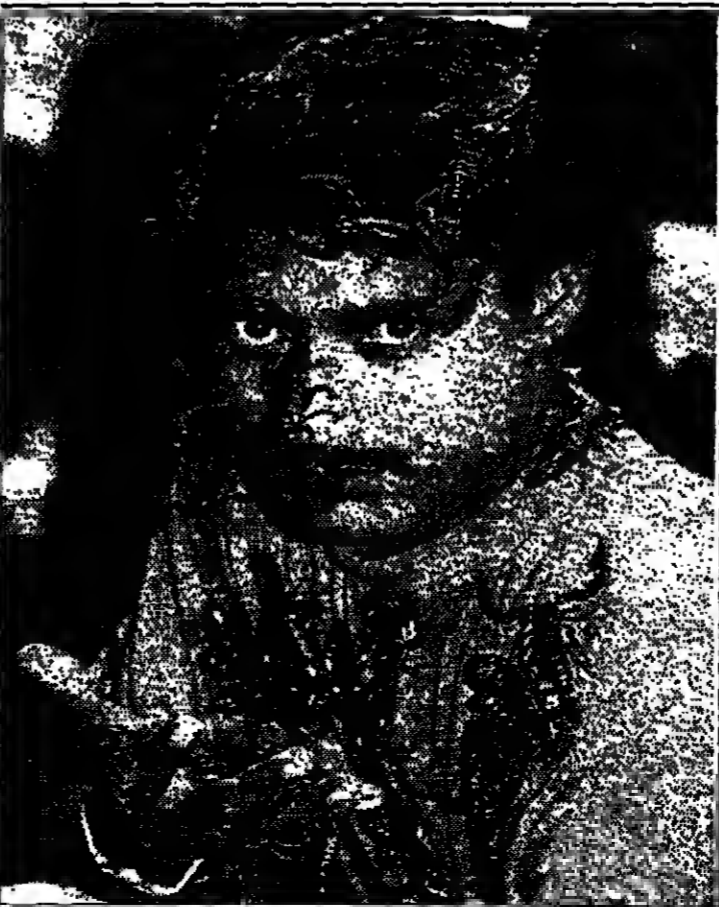
This street hawker has no trouble with shoppers squeezing the merchandise. He sells scorpions to Calcutta men seeking to upgrade their sex drive. The oil squeezed from a dead scorpion is used in India as an aphrodisiac.